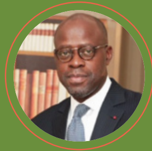
Alain-Richard DONWAHI Minister of Water and Forests