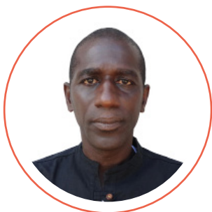
Youssouf DOUMBIA President of the Executive Board, OIREN (National observatory for sustainable management of natural resources in Côte d’Ivoire)

Of course, there will be areas where cocoa farmers will be relocated, because we aim to recover 20% of national forest cover by 2030. Furthermore, environmental and social safeguarding measures will be implemented, as human rights are a key aspect of the new forestry policy.”