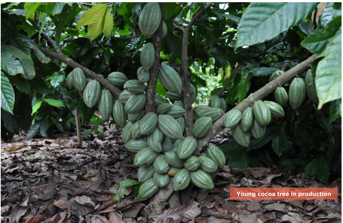
Young cocoa tree in production

• Compensatory reforestation and reforestation operations undertaken by timber operators, under partnership agreements, in classified forests, covering areas of 2 263 ha and 2 898 ha respectively.